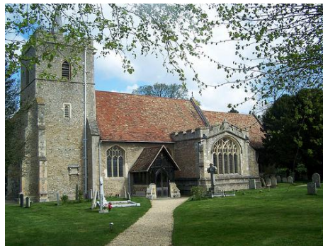
All Saints Church, Little Shelford