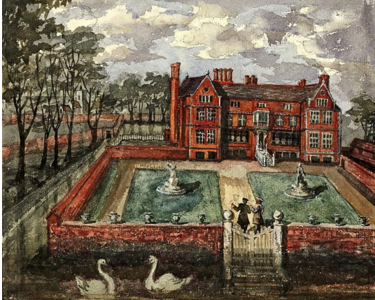
Little Shelford Manor