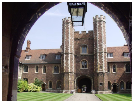
Queen's College, Cambridge University