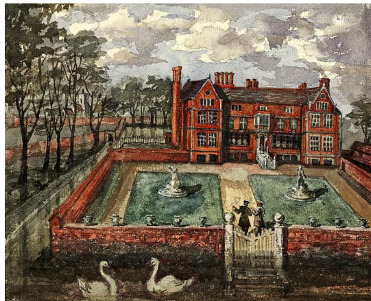
Little Shelford Manor