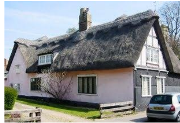
The old 'George & Dragon' Public House, Great Shelford