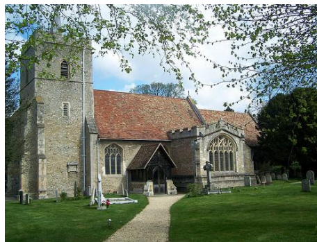
All Saints Church, Little Shelford