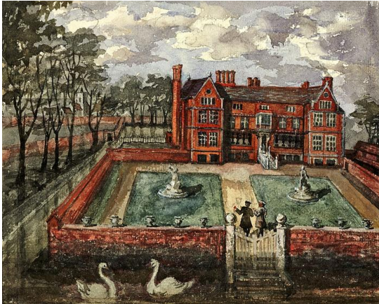
Little Shelford Manor House