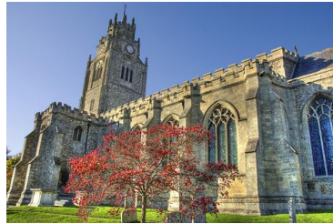
St Andrew's Church, Sutton