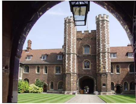
Queen's College, Cambridge University