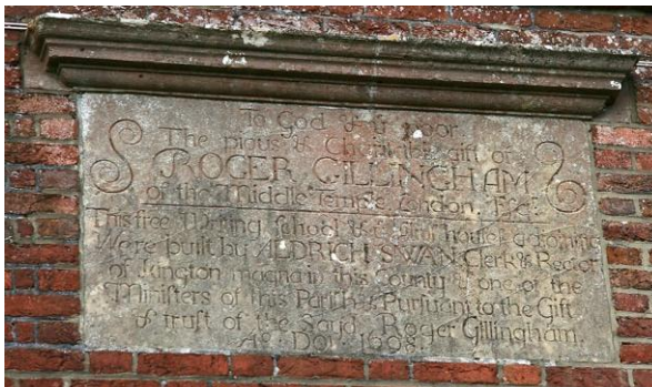
Inscription - Pamphill Free School