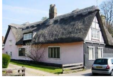
The old 'George & Dragon' Public House, Great Shelford